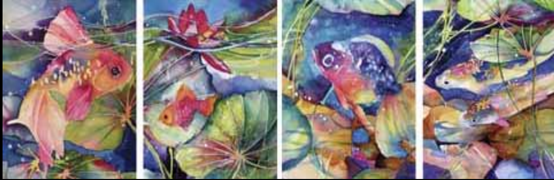
"Pondside" each 16" x 20"

A non-profit art center located at 813 Sophia Street in the Historic Silversmith's House