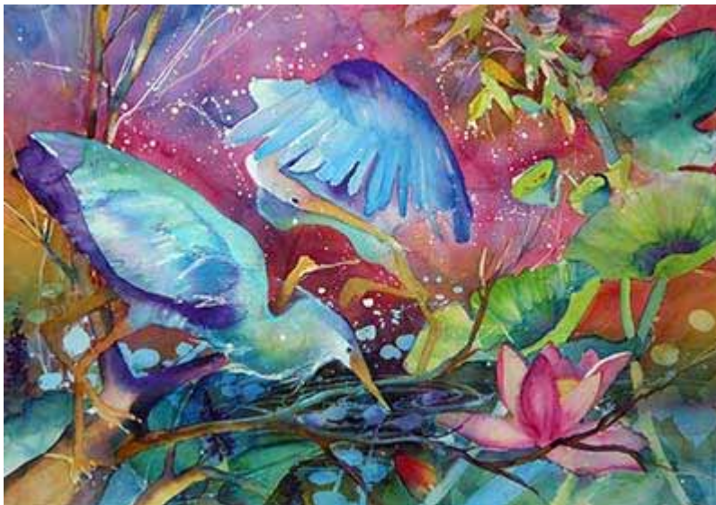
"Egret & Lotus" 36" x 60"