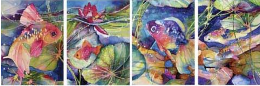
"Pondside" each 16" x 20"

A non-profit art center located at 813 Sophia Street in the Historic Silversmith's House