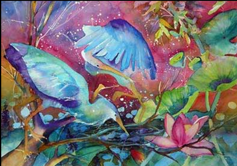
"Egret & Lotus" 36" x 60"